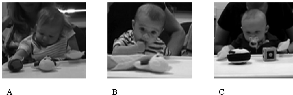
Figure 1. Mittens training in active (A), observational (B), and generalization conditions (C).

Mittens observational training. The amount of time each active infant engaged in object-directed activity on each toy (see the Coding section) was used to generate a training script for the yoked infant in the observational condition. This measure was chosen because it was the critical component relating individual differences in activity with mittens and infants' looking times to others' actions as seen in Sommerville et al.'s (2005) study. During the training session, one experimenter wore a Velcro mitten and placed both toys just out of the